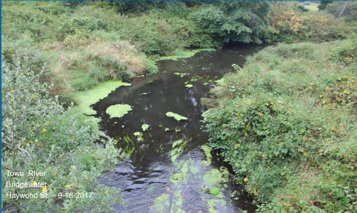
Town River Bridgewater Haywood St. - 9-18-2017