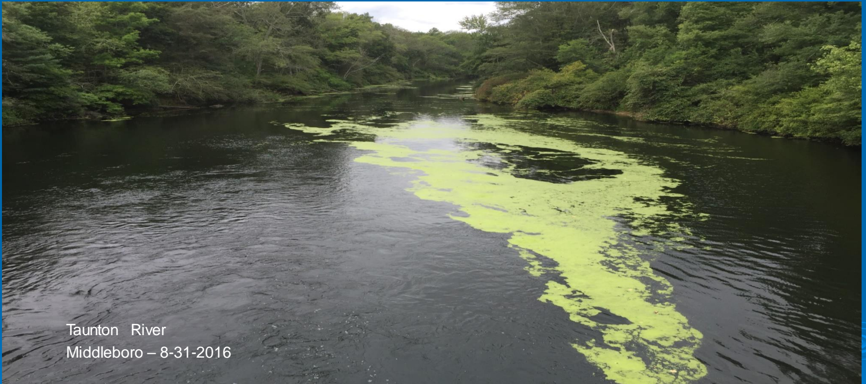
Taunton River Middleboro – 8-31-2016